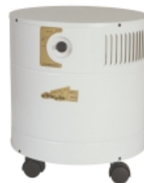
AllerAir™ 4000 DS 15 lbs. activated carbon