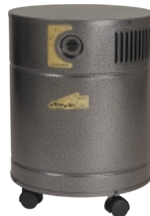
AllerAir™ 5000 DS 21 lbs. activated carbon